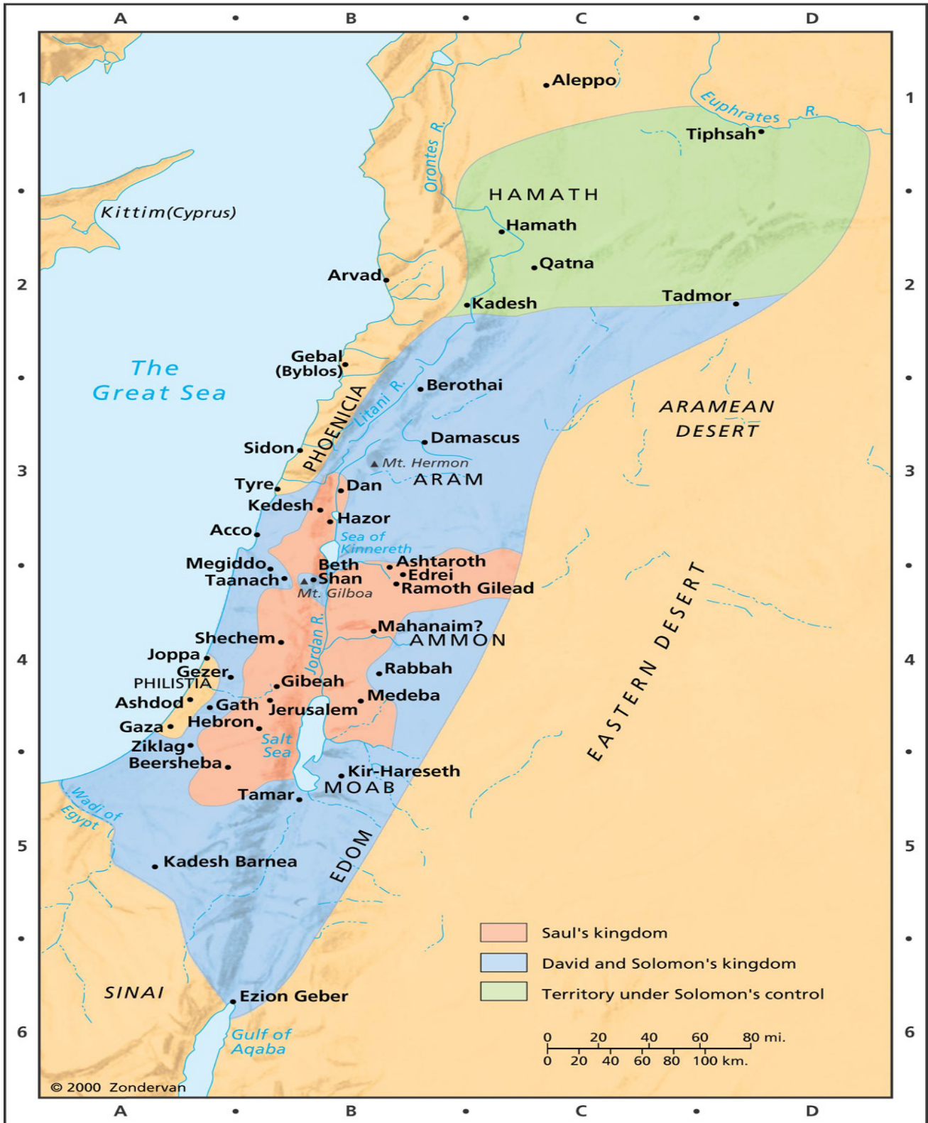
Map 5: KINGDOM OF DAVID AND SOLOMON