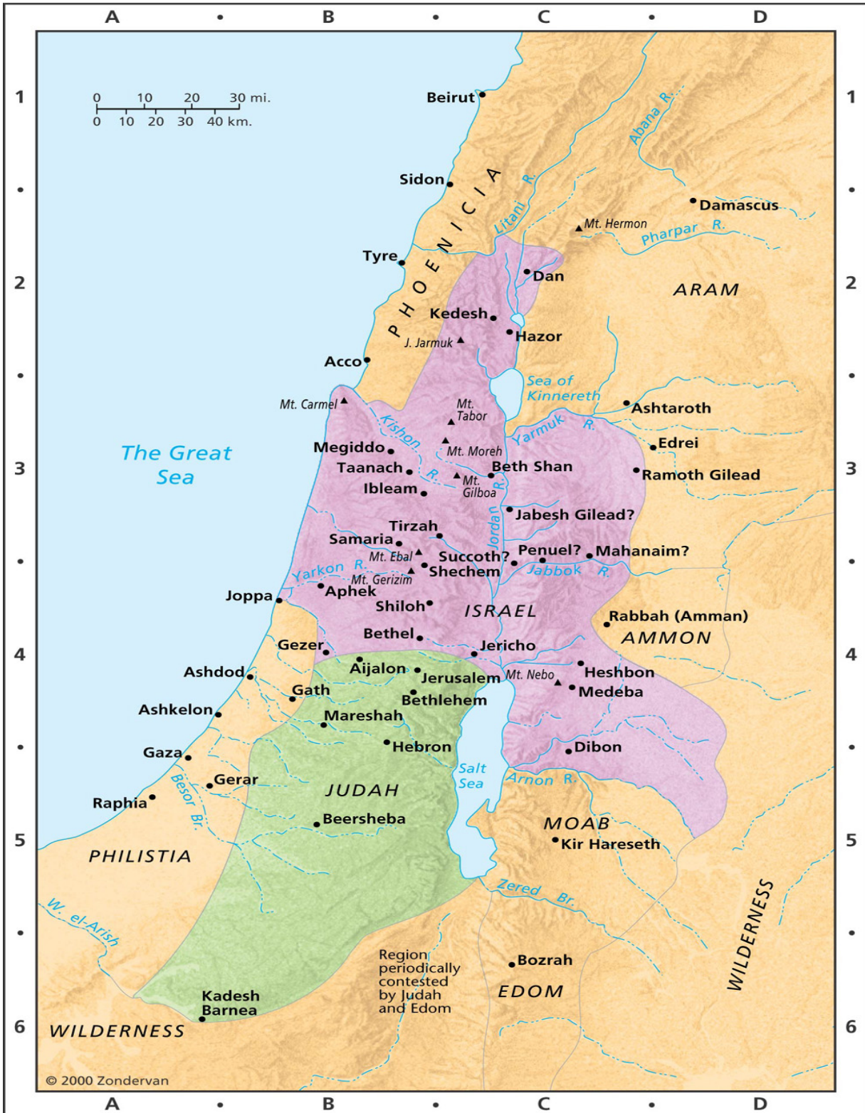
Map 6: KINGDOMS OF ISRAEL AND JUDAH